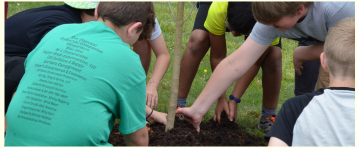
Students plant a tree in celebration of Arbor Day.